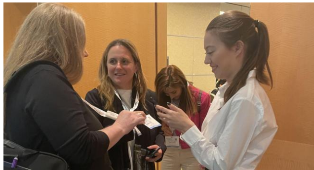
Badge scanning is awkward. Why put your attendees through this?

There hasn't yet been an alternative that is low cost, easy to deploy and delivers the required outputs, reliably. Until now.