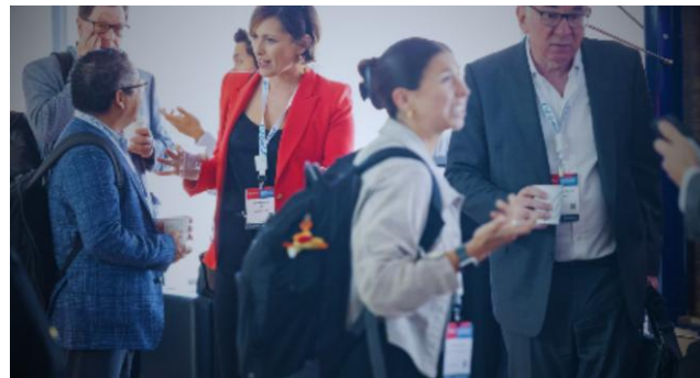
Delegates enjoying the freedom of a seamless event experience.