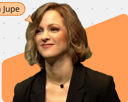
VP Digital Projects & Services at H&R Block

"Using Miro, my teams have created strategic alignment plans, culture workshops, journey maps, and evolved how we work. In many ways it brought us closer together."