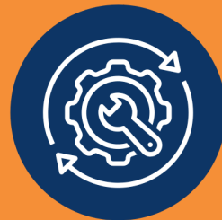
Project Services & Support